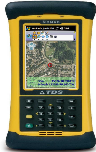
Nomad® Pocket PC Running ArcPad