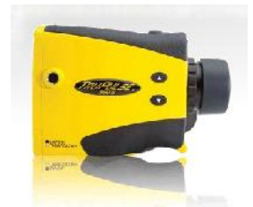
TruPulse 360B Used for GPS Offsets