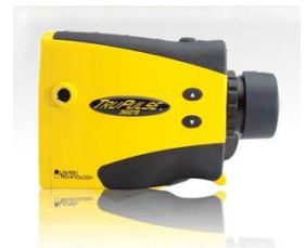
TruPulse 360B Used for GPS Offsets