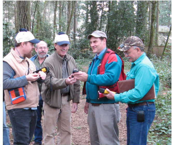
Field Session with ArcPad on Pocket PCs