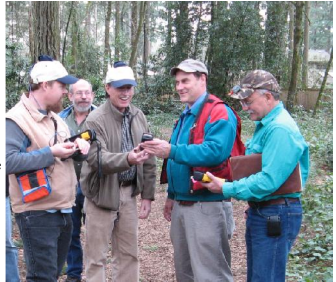
Field Session with ArcPad on Pocket PCs