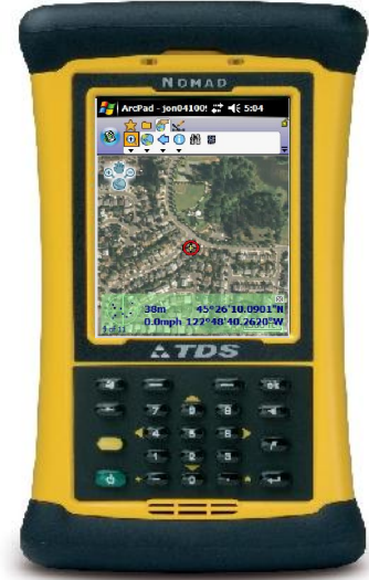
Nomad® Pocket PC Running ArcPad